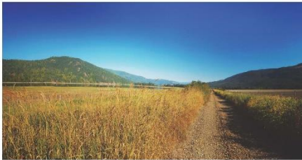
Sicamous-to-Armstrong Rail Trail