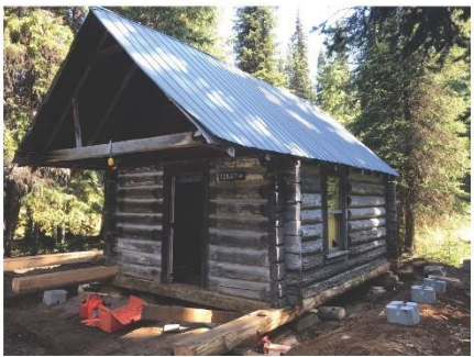
Owlhead Cache Cabin