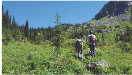
Twin Lakes Trail, Eagle Pass